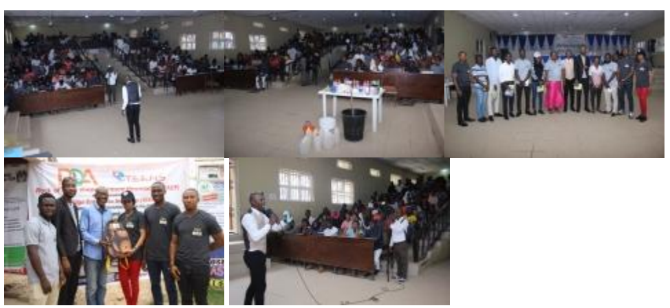
OTHER PICTURES OF THE PICTURE