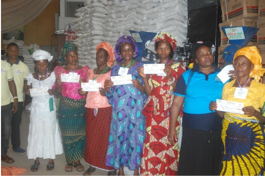
Cheques Presented to the beneficiaries by the Program Director