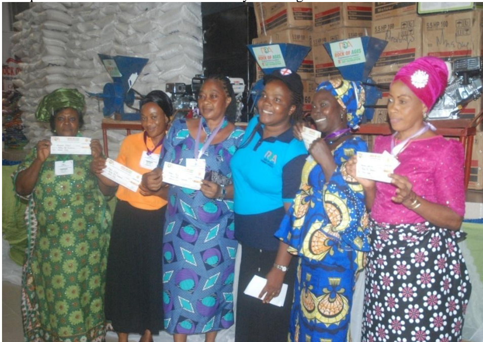
Cheques Presented to other beneficiaries by the Program Director