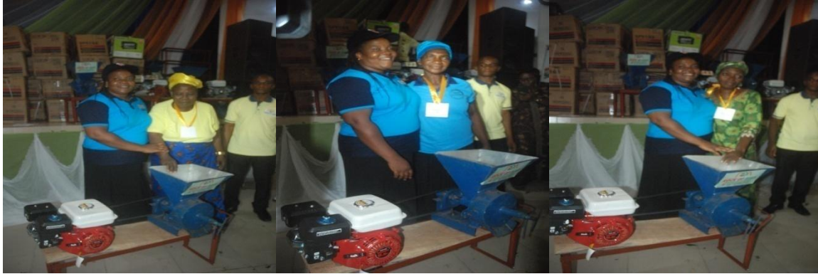
Grinding Machines Presented to beneficiaries by the Program Director