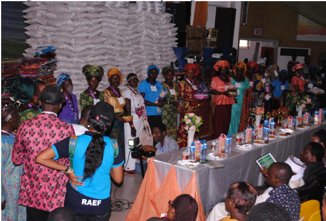
Other Beneficiaries at the Event