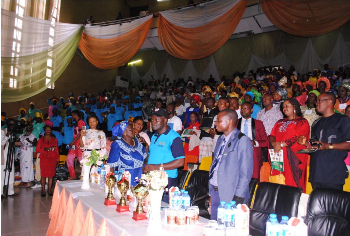
Picture Showing the Founder, Dignitaries and Widows