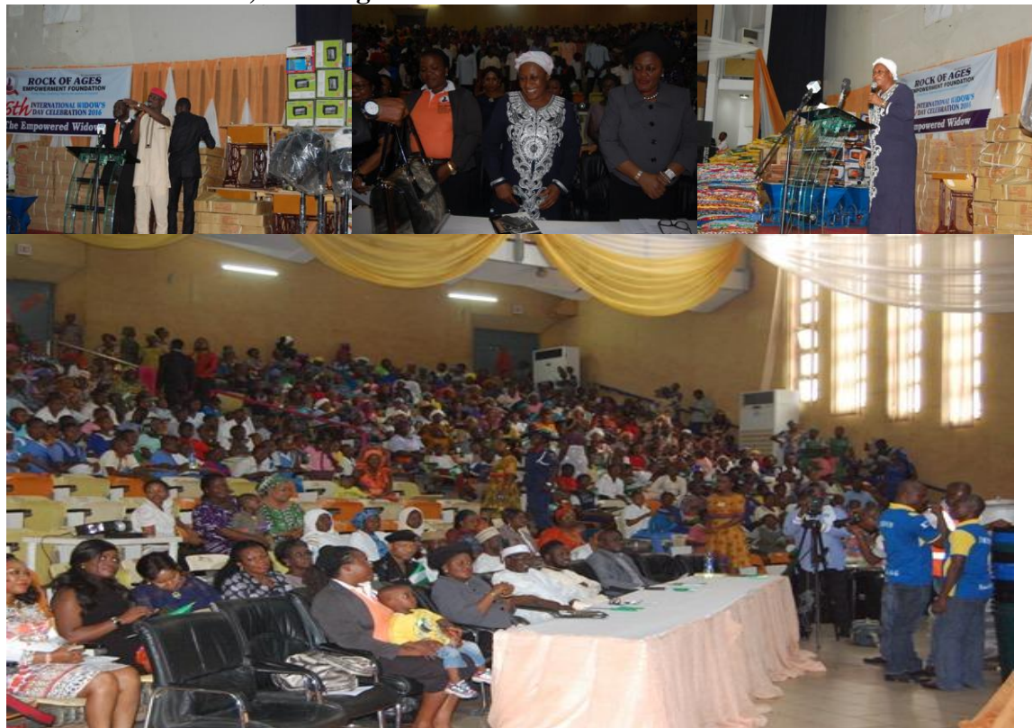
Table 1; Empowerment