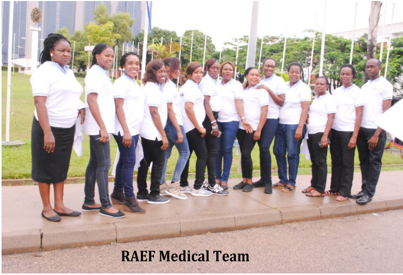
RAEF Medical Team