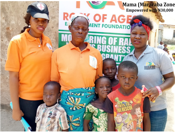
Mama (Mararaba Zone) Empowered with N30,000