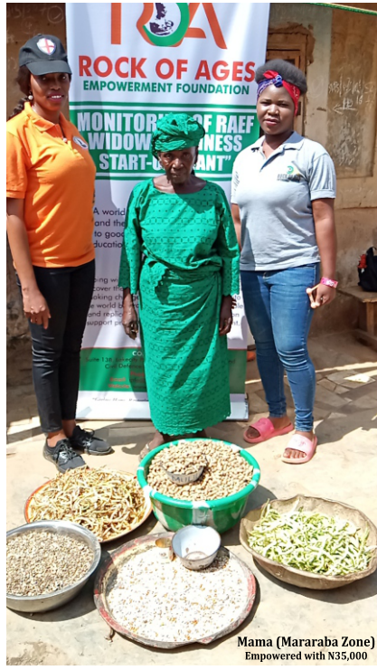
Mama (Mararaba Zone) Empowered with N35,000