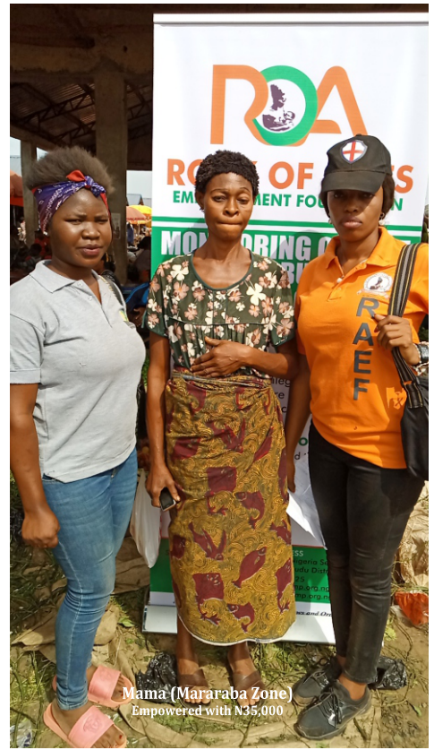
Mama (Mararaba Zone) Empowered with N35,000